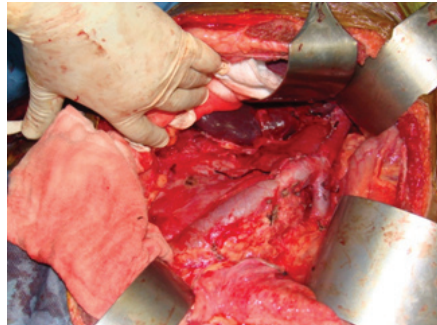
[Table/Fig-1]: MRI showing right side of kidney replaced by RCC [Table/Fig-2]: MRI (coronal section) showing right sided RCC with extension in IVC. [Table/Fig-3]: Right sided nephrectomy along with IVC portion of tumor extension.